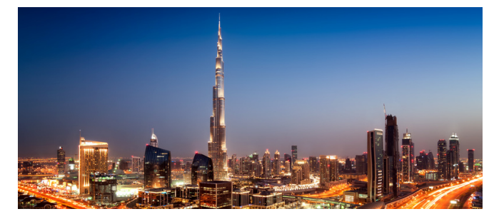
The Downtown Dubai

Since 2021, the Expo has been serving the public by showcasing the latest developments of nations for the World Fair, with a focus on opportunity, mobility, and sustainability. Located in close proximity to Dubai Investment Park and Al Maktoum International Airport, it has emerged as a prominent place within the City of Dubai.